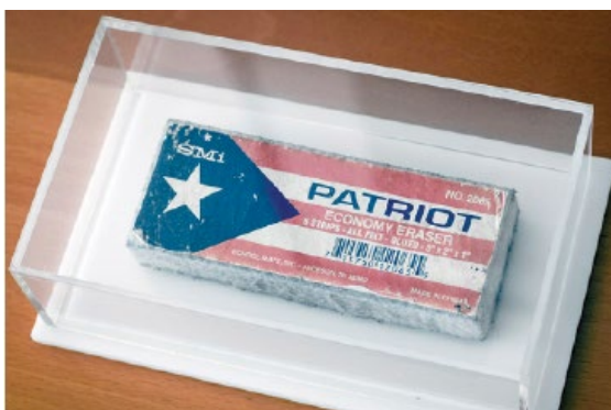
Figure 9 Patriot Economy Eraser. The Museum of the Old Colony.