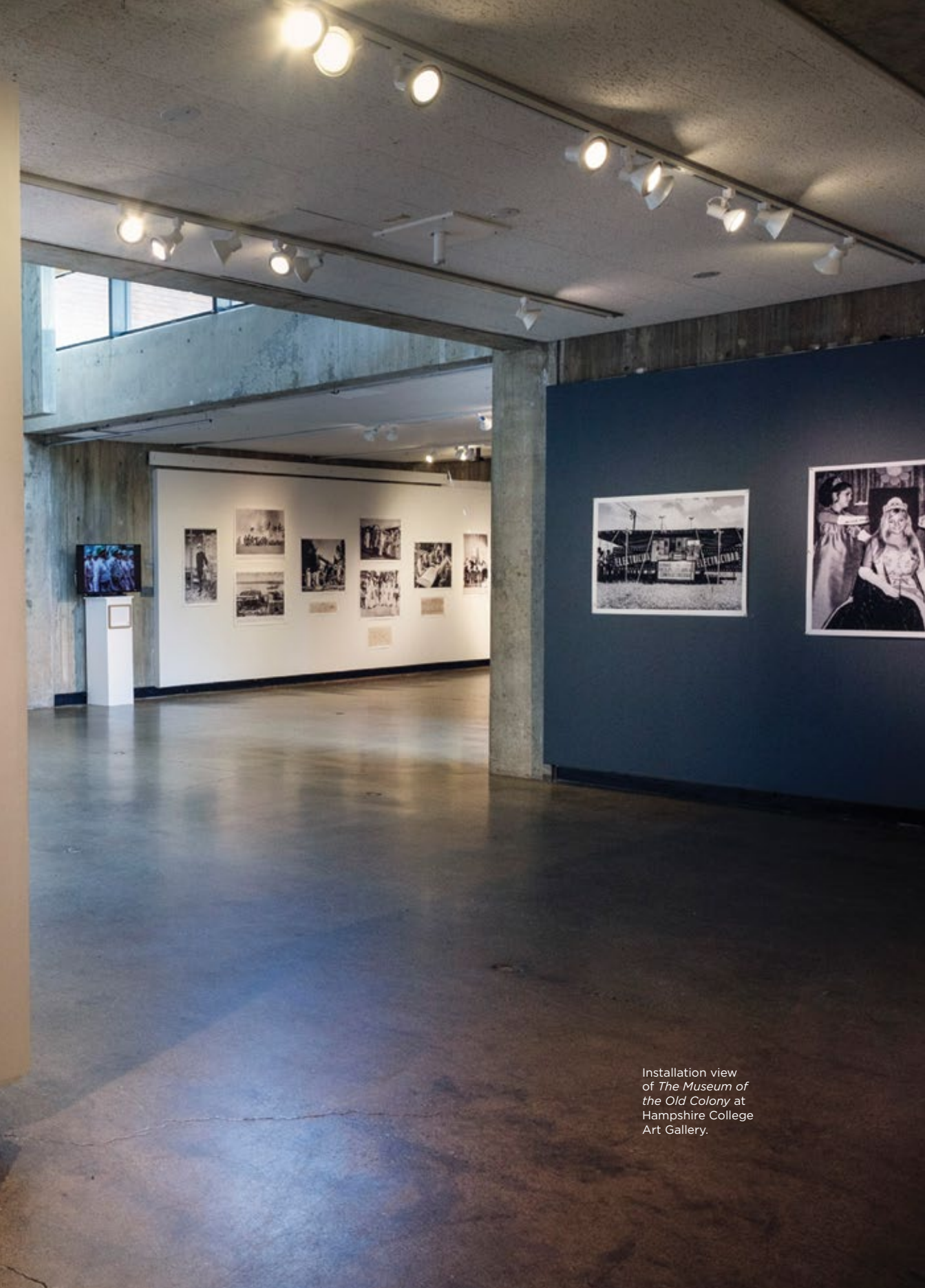
Installation view of The Museum of the Old Colony at Hampshire College Art Gallery.