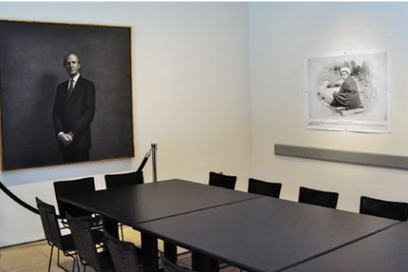
Figure 7 Installation view of The Museum of the Old Colony at the King Juan Carlos I of Spain Center at New York University, where Delano’s materials were integrated with the existing space, including a portrait of the King (left).