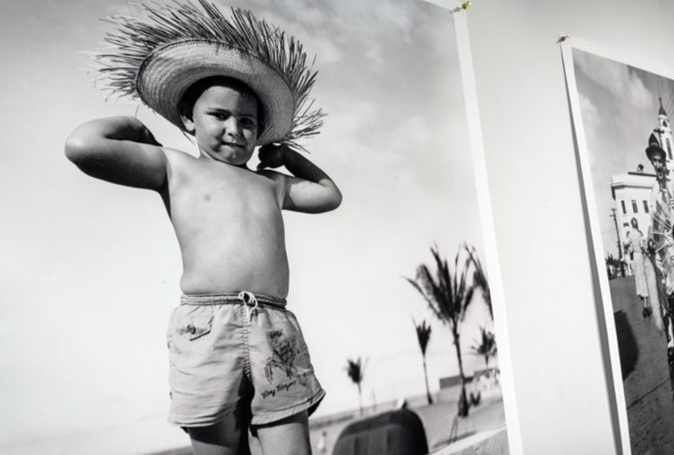
Figure 8 Healthiest, San Juan, Puerto Rico, 1960, Hamilton Wright, New York. Installation view from The Museum of the Old Colony .

born and raised, and with the complicity of photography — Delano’s usual creative medium and that of his documentary-photographer father, Jack Delano — in the imperial enterprise.