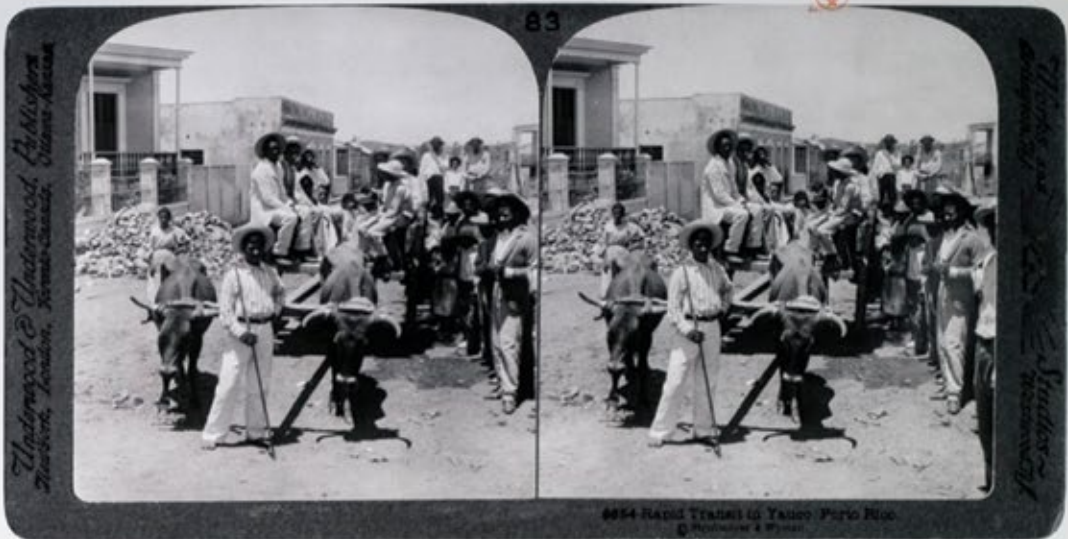
8854 NAKED TRAIL IN YAKO PORTO RICO