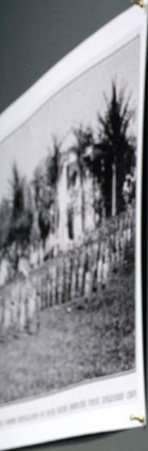
...AND DISCUSS A NEW AND IMPROVED TROPICAL CLIM.