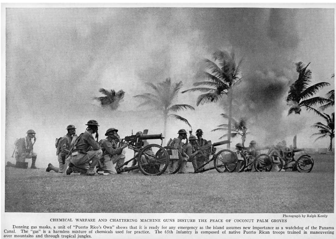
Figure 6 Chemical Warfare and Chattering Machine Guns Disturb the Peace of Coconut Palm Groves. Puerto Rico: Watchdog of the Caribbean – Venerable Domain under American Flag Has New Role as West Indian Stronghold and Sentinel of the Panama Canal, National Geographic , December, 1939.

Meléndez and Osvaldo Budet), Puerto Rican art incorporates texts as a reaffirmation of a shared history. With The Museum of the Old Colony , Delano joins this tradition, but adds a new twist: the words, just like the images, are those of the colonizer, quoted directly. Women are described as “dusky belles” and “muscular half-breeds”; other subjects are described with phrases such as “little natives” and “Spanish white trash.” Those in power utilize such terminology within the self-assurance of their biased beliefs that the supposedly “simple” colonized subjects, with their supposed intellectual “shortcomings,” cannot comprehend it. Delano’s installation addresses this absurd notion head-on, transforming the aggressor’s weapons into the instrument of his own destruction, fulfilling the dictum “Hate oppression; fear the oppressed.” [Figure 6]