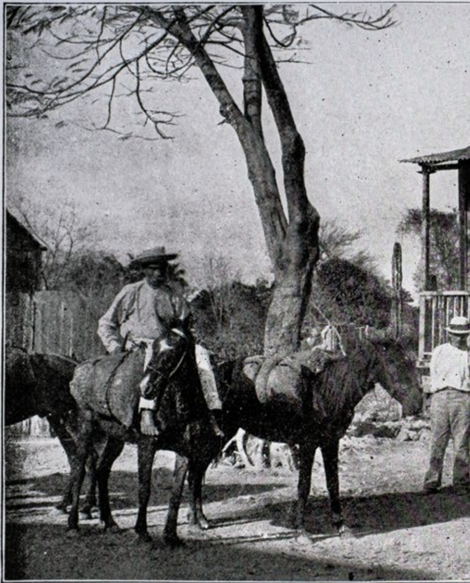
TYPICAL NAT The farming class is about on a par with the poor darkies down South, full-blooded Ethiopians.