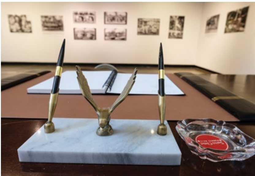
Figure 10 Installation view with executive desk, patriotic pen set, and guest book. The Museum of the Old Colony.

contemporary issues about which museums have historically preferred to remain silent. 6