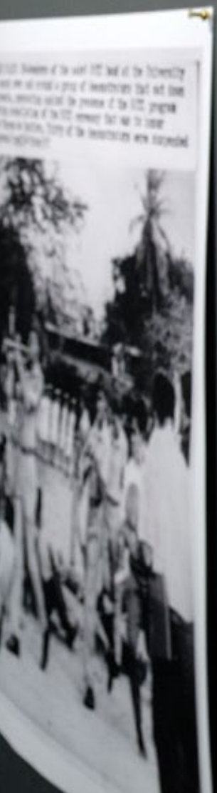
...of the most ... and of the University ... and ... a group of ... that not ... the ... of the ... program ... of the ... that ... to ... of the ... were ...