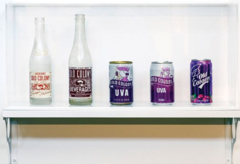
Figure 4 Old Colony Beverage Timeline. Original Old Colony bottles and cans, 1940s–2017, Mayagüez, Puerto Rico. Installation view from The Museum of the Old Colony .

Named in part for the popular brand of soda Old Colony [Figure 4], manufactured on the island since 1940, The Museum of the Old Colony also alludes to the island’s complex political status in relation to the United States, and as arguably the world’s oldest continual colony (beginning with Spanish rule in 1493). The installation — conceived anew as a conceptual unit for each venue where the Museum materializes — is assembled from a continually growing collection of more than a century of archival imaging of Puerto Rico and Puerto Ricans. Ranging from military scenes to newly established American schools [Figure 5] (in which children imbibe “American values” from dressing up as cowboys and pilgrims, or gathering reverently around a portrait of Abraham Lincoln) to the “native types” typical of anthropological inquiry [Figure 6], these images were largely produced by and for the U.S. and originally displayed, disseminated and interpreted in museums and magazines, newspapers and postcards, books and government reports. Each partakes in the construction of racialized, often primitivist stereotypes or the lauding of U.S. intervention, in turn naturalizing and legitimating U.S. rule.