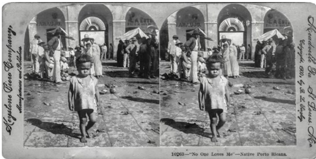
No One Loves Me Native Porto Ricans, Keystone View Company, Meadville PA, photograph by B.L. Singley, 1900. Part of The Museum of the Old Colony .

Afraid? What of? What is there to be afraid of? Who are the Yankees to fear them? Why fear them?