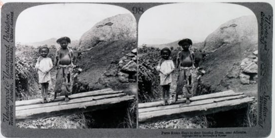
PORT RICO BOYS IN THEIR BATHING DRESS, near ALICIA.